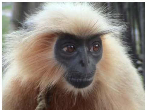
Captive Golden Langur in Ripu Reserve Forest