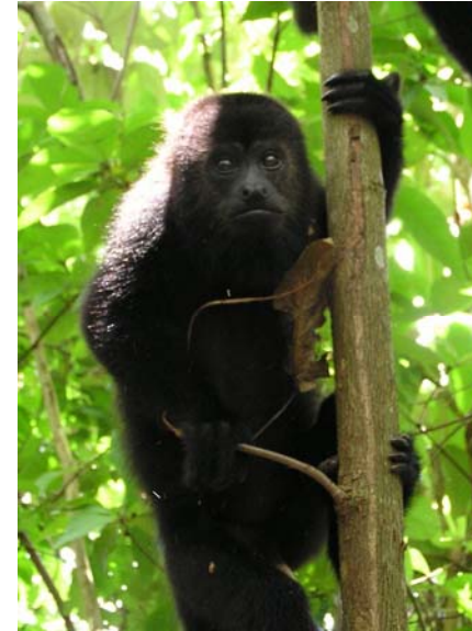
Black Howler Monkey of Belize