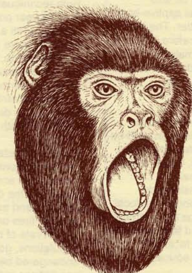
Black howler monkey ( Alouatta pigra )

A feasibility study found translocation to be a viable conservation tool because the causes of the prior local extinction (yellow fever, hurricanes, and over-hunting) were no longer present in Cockscomb. Additionally, there had previously been an alarming rate of deforestation in the area (Koontz et al. , 1994), which was no longer occurring. Also, natural colonization in the Cockscomb Basin was deemed improbable because howlers had not been seen or heard in the area since 1978. Thus, because hunting was now controlled within the 100,000-acre park, and yellow-fever epidemics had not been reported for nearly 40 years in the immediate area, it seemed reasonable to attempt re-introduction of the species into the protected area.